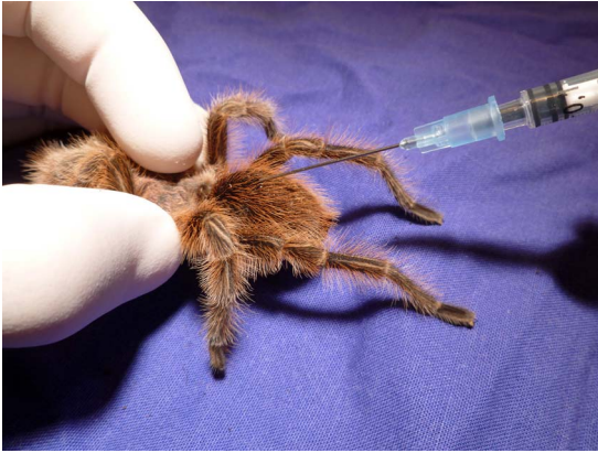
Figure 1. Intracardiac hemolymph withdrawal technique from an adult female Grammostola rosea , macroscopically.

maximum hemolymph volume in ml was chosen as 10% of the physiologic hemolymph volume. The amount of hemolymph required by the analyzer was 0.09 ml, just below the 0.10 ml maximum for the smallest animal. Hemolymph samples were obtained using heparinized (Heparin-Natrium-25000-ratiopharm®, 5000 UI/ml) 1-ml syringes fitted with 23-ga needles (BD Micro-lance™ 23 G 1-inch No. 16 0.6–25 mm, Henry Schein, Langen, Hessen, 63225, Germany). These samples were directly transferred to a 1-ml lithium heparin tube (Multivette® 600 LH, Sarsstedt AG & Co., Nümbrecht, Nordrhein-Westfalen, 51588, Germany) and centrifuged with an EBA 20 centrifuge (Andreas Hettich GmbH & Co. KG, Tuttlingen Baden-Württemberg, 78532, Germany) at 3.46 x g for 10 min. Hemolymph supernatant was extracted and examined by a VetScan® Point-of-Care Blood Analyzer, Model No. 200-1000 (Abaxis Inc, Union City, CA 94587, USA) using Avian-Reptilian Profile Plus reagent rotors.